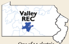
One of 14 electric cooperatives serving Pennsylvania and New Jersey

Valley Rural Electric Cooperative, Inc. 10700 Fairgrounds Road P.O. Box 477 Huntingdon, PA 16652-0477 814/643-2650 1-800-432-0680 www.valleyrec.com