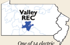
One of 14 electric cooperatives serving Pennsylvania and New Jersey

Valley Rural Electric Cooperative, Inc. 10700 Fairgrounds Road P.O. Box 477 Huntingdon, PA 16652-0477 814/643-2650 1-800-432-0680 www.valleyrec.com