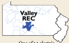
One of 14 electric cooperatives serving Pennsylvania and New Jersey

Valley Rural Electric Cooperative, Inc. 10700 Fairgrounds Road P.O. Box 477 Huntingdon, PA 16652-0477 814/643-2650 1-800-432-0680 www.valleyrec.com