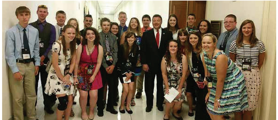
CONGRESSIONAL VISIT: U.S. Rep. Bill Shuster (R-9th), center right, speaks to Youth Tour students during the 2015 tour. In addition to the congressional visits, students learn about the cooperative business model, attend a theater performance, go sightseeing and take a Potomac River cruise.

More than 40,000 students from rural areas and small towns across America have participated in this unique program. The featured speakers during National Youth Day provide insight regarding the important roles electric cooperatives play in their communities and in the nation. Students gain a personal understanding of American history and their responsibility as citizens by meeting their representatives and sen-