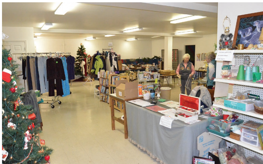
NICE PLACE TO SHOP: Shoppers entering the thrift store will find a clean and tidy shop with a variety of clothing and household goods.

The store has become something of an exchange. People drop off donated items