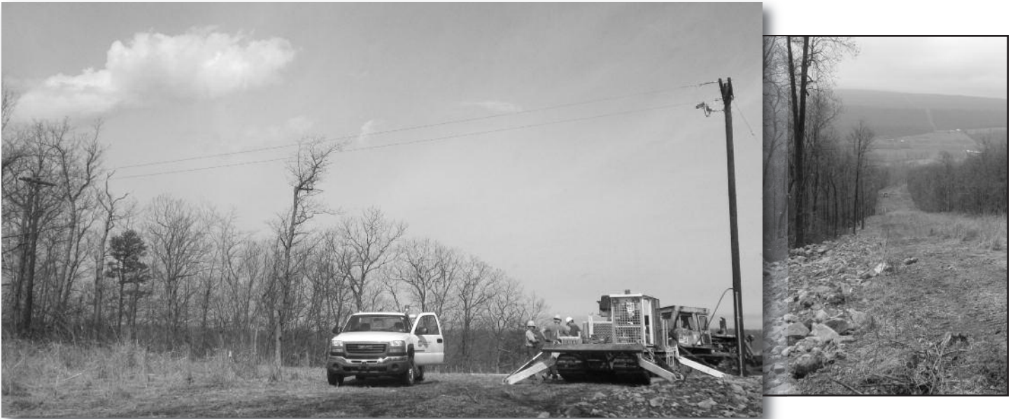
Above: A Valley REC crew erects one span of overhead line near the site of the new Juniata County communications tower in Lack Township in April. The span crosses a natural gas pipeline. Top right: The pipeline cut provides a great view from Blacklog Mountain looking south toward Rt. 35. Right: Boyd Gelvin (left) and Jason Wilson connect underground wiring in a deep well box.

office relied on the radio tower along Route 74 near Ickesburg, but there were areas of Blacklog that were not covered.